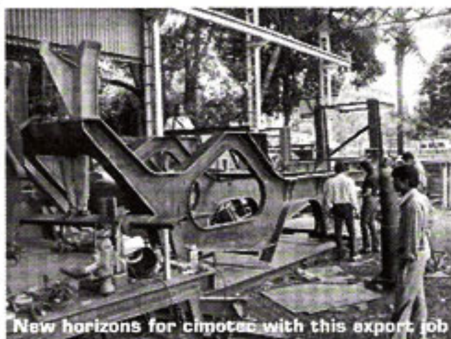
New horizons for cimotech with this export job

small scale industry engaged in the manufacture of medium/heavy fabrication catering to multinationals viz. Otis Elevators, Ingersoll-Rand, Tata Trucks, Tracktech International, L. M. Glasfiber India, APW President Systems, Westfalia Sperator India, SAB Wabco, etc.