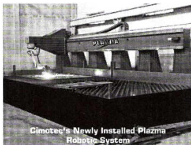
Cimotech's Newly Installed Plasma Robotic System

The Robotic Plasma Cutting System developed by M/s. Plazma Pune is the first of its kind in India. Recently this system won the best design CMTI-PMT award at IMTEX'2004.